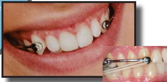
Carrière Motion to correct bite discrepancies between the upper and lower teeth.